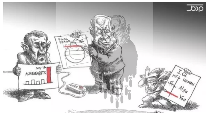
Neyestani: Lower life forms of Middle East