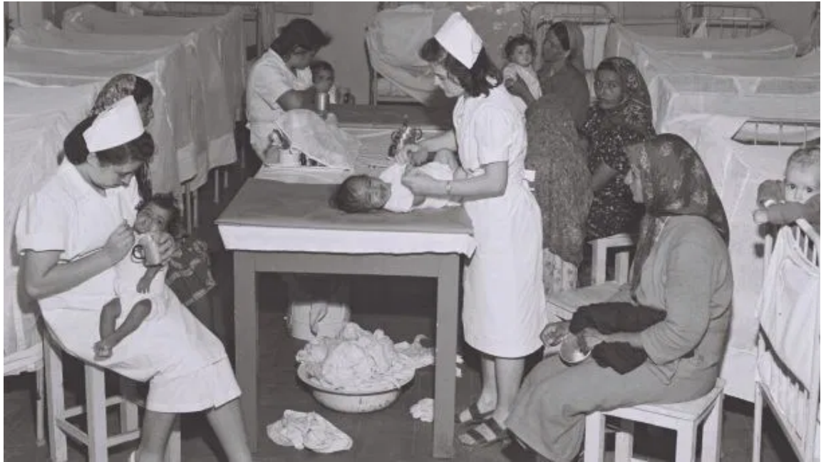
Yemenite babies treated by Israeli nurses: note suspicious glance cast by mother on right

One of the most ghoulish reports concerns four babies who were hospitalized because they were malnourished. Though they were in stable condition, doctors decided to inject them with "dry protein." In the 'understated' words of the chief of staff of the Rosh HaAyin hospital: