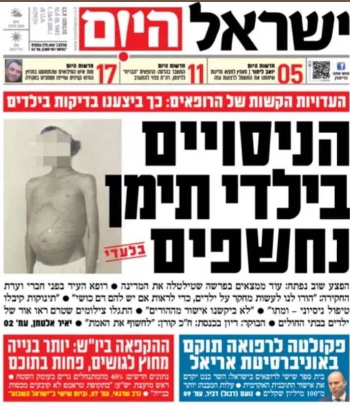
Lead headline in Israel HaYom. Caption: “[Medical] Experiments on Yemenite Children Exposed”

In addition, the scandal also involved the U.S. National Institutes of Health, which paid Israeli hospitals nearly $1-million (in current value; then it was 160,000 Israeli lira) to provide fetuses of dead Yemenite babies and corpses of adults which were used in medical experiments to determine why Yemenites did not develop heart disease. One doctor sought to prove that Yemenites were of African descent. To do so, he tested the blood of dead Yemenites to determine if they had sickle-cell anemia. He even wrote a medical paper about his claims. In their testimony, the doctor who reported on this arrangement said they had called the Yemenites kushim , which is roughly equivalent to “darkie” or “N****r.”